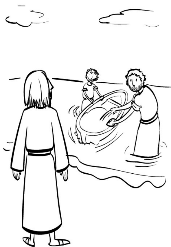
Jesus said to them, "Come after me, and I will make you fishers of men."

District 10 Al-Anon - Courage to Change will be having their 22 Al-Anon Anniversary on Saturday, Jan. 28, 2017 at 7:30pm at St. Pius X Church basement, 106 St. Peter's Road, Charlottetown. There will be an AA and Al-Anon speaker. Lunch will be served. To know more about Al-Anon call (902)894-3503 or visit www.freewebs.com.alanonmaritimes